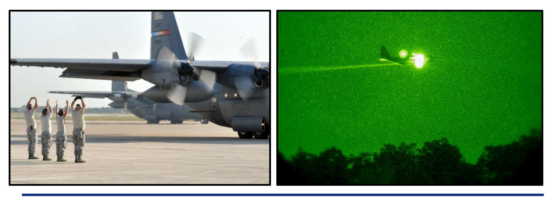
Fly, Fight and Win...