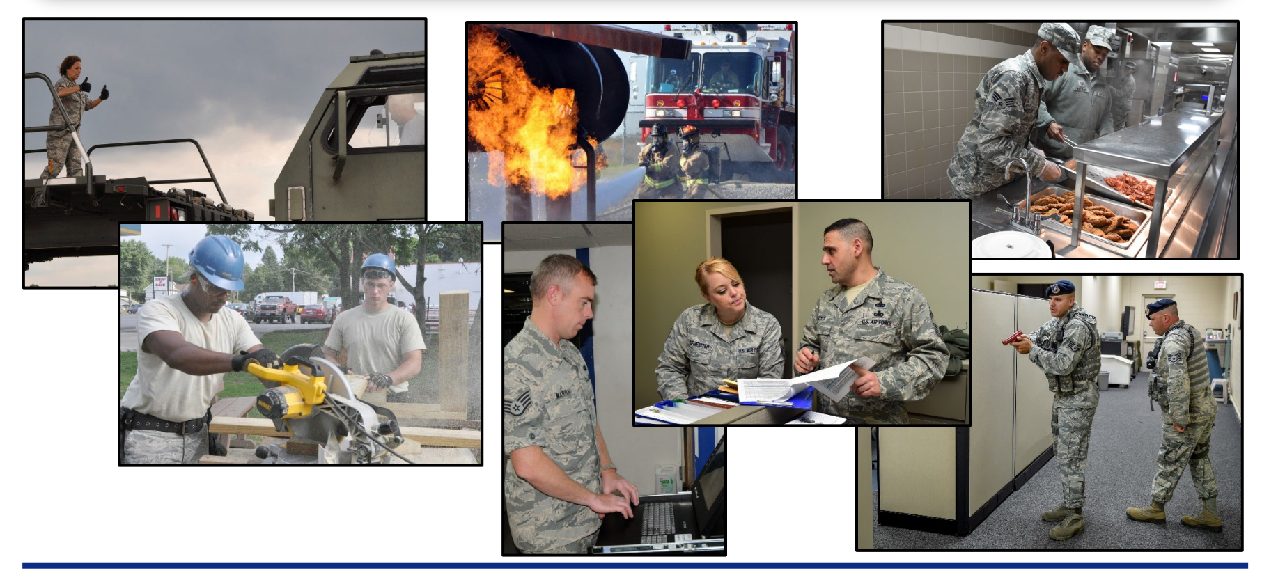
Fly, Fight and Win...

The 910th Mission Support Group provides Agile Combat Support to the warfighter through the capabilities of the 76th Aerial Port Squadron, the 910th Civil Engineering Squadron/910th Civil Engineering Fire Department, 910th Communications Squadron, 910th Force Support Squadron, 910th Logistics Readiness Squadron, and the 910th Security Forces Squadron